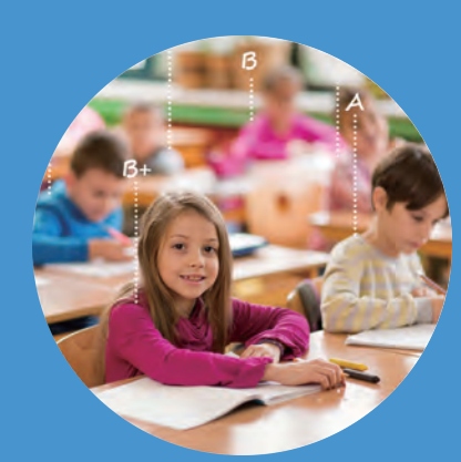
Performance ranking makes everyone more likely to participate in classroom activities